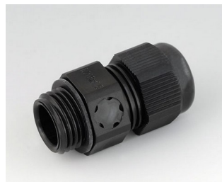
C2316919 Cable gland M16x1.5, pressure compensation PA black RAL 9005