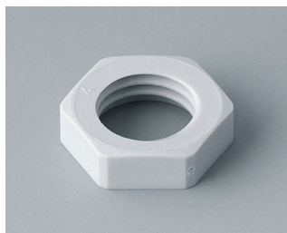
C2312117 Counternut M12x1.5 PA light grey RAL 7035