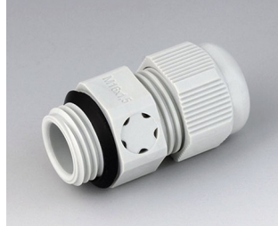
C2316917 Cable gland M16x1.5, pressure compensation PA light grey RAL 7035