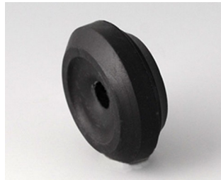
C2320159 Cable grommet TPE (UL 94 V-0) black RAL 9005