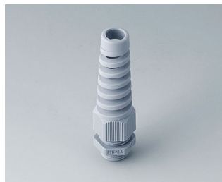
C2316518 Cable gland M16x1.5, bending protection PA silver grey RAL 7001