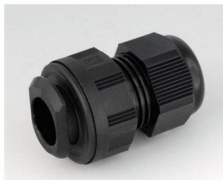
C2320719 Quick fix cable gland, M20 PA black RAL 9005 IP 68