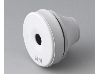
C2320137 Cable grommet EPDM light grey RAL 7035