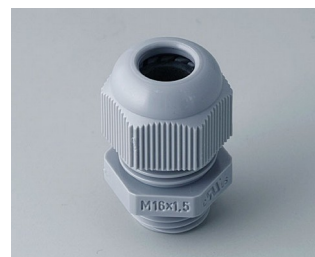
C2316418 Cable gland M16x1.5 PA silver grey RAL 7001