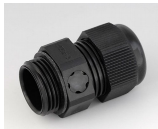
C2320919 Cable gland M20x1.5, pressure compensation PA black RAL 9005 IP 68