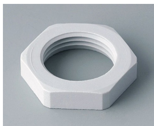
C2320117 Counternut M20x1.5 PA light grey RAL 7035