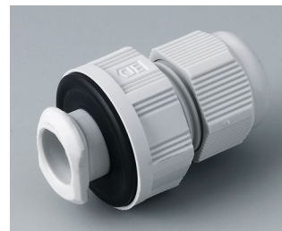
C2316717 Quick fix cable gland, M16 PA light grey RAL 7035