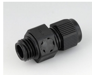
C2312919 Cable gland M12x1.5, pressure compensation PA black RAL 9005