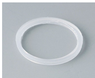
C2320126 Sealing ring for external thread M20x1.5 PE natural-coloured