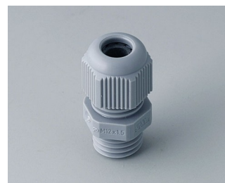
C2312418 Cable gland M12x1.5 PA silver grey RAL 7001