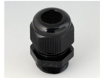
C2320419 Cable gland M20x1.5 PA black RAL 9005