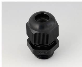
C2316419 Cable gland M16x1.5 PA black RAL 9005