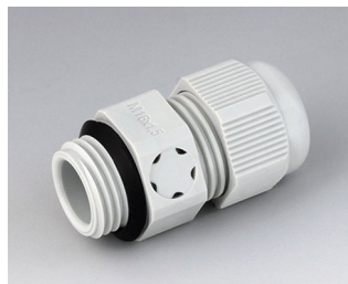
C2316917 Cable gland M16x1.5, pressure compensation PA light grey RAL 7035