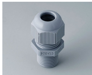
C2316618 Cable gland M16x1.5 PA silver grey RAL 7001