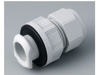
C2320717 Quick fix cable gland, M20 PA light grey RAL 7035