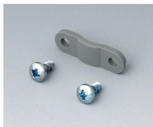
A9199005 Strain relief PA 6 volcano