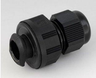
C2316719 Quick fix cable gland, M16 PA black RAL 9005