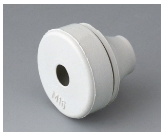
C2316137 Cable grommet EPDM light grey RAL 7035