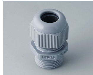
C2320418 Cable gland M20x1.5 PA silver grey RAL 7001