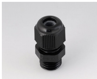
C2312419 Cable gland M12x1.5 PA black RAL 9005