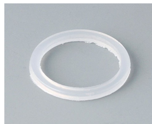
C2316126 Sealing ring for external thread M16x1.5 PE natural-coloured