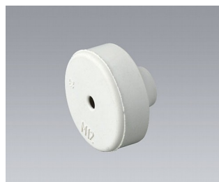
C2312137 Cable grommet EPDM light grey RAL 7035