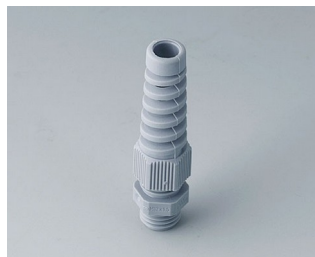
C2312518 Cable gland M12x1.5, bending protection PA silver grey RAL 7001