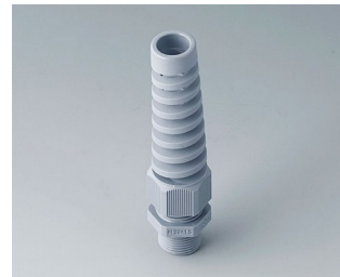
C2320528 Cable gland M20x1.5, bending protection PA silver grey RAL 7001