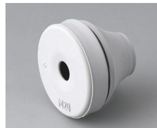
C2320137 Cable grommet EPDM light grey RAL 7035