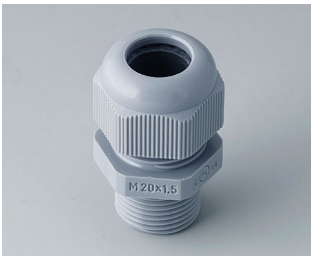
C2320428 Cable gland M20x1.5 PA silver grey RAL 7001