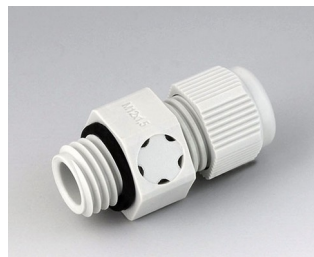
C2312917 Cable gland M12x1.5, pressure compensation PA light grey RAL 7035