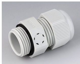
C2320917 Cable gland M20x1.5, pressure compensation PA light grey RAL 7035 IP 68