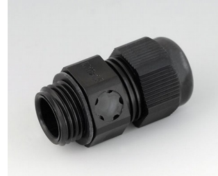
C2316919 Cable gland M16x1.5, pressure compensation PA black RAL 9005