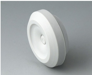
C2320147 Cable grommet TPE light grey RAL 7035