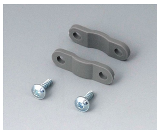
A9166004 Set of pull-relief PA 6 volcano