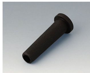
C2353849 Flexible cable grommet Ø 5,3 black