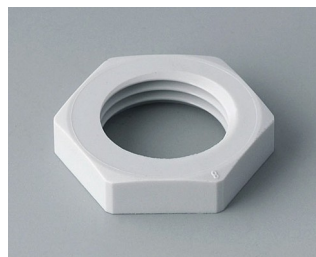
C2316117 Counternut M16x1.5 PA light grey RAL 7035