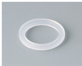
C2312126 Sealing ring for external thread M12x1.5 PE natural-coloured