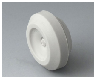
C2316147 Cable grommet TPE light grey RAL 7035